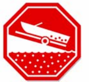
Prevent the transport of nuisance species. Clean all recreational equipment. www.ProtectYourWaters.net

Help care for the land, water and cultural resources along the Clarion River by respecting wildlife, nature and other recreationists. Washing footwear, boats and vehicles minimizes the spread of invasive species from one place to another. "Leave No Trace," a national outdoor ethics program, provides guidelines for minimizing your impact. Visit www.LNT.org for more information.