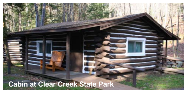
Cabin at Clear Creek State Park

Mile 63 (RR) Loleta Recreation Area was built in the 1930's by the Civilian Conservation Corps on the site where, just 20 years earlier, a bustling logging town of 600 inhabitants stood. The Allegheny National Forest operates the recreation area, which offers tent and RV camping, restrooms, showers, picnic pavilions, swimming and hiking.